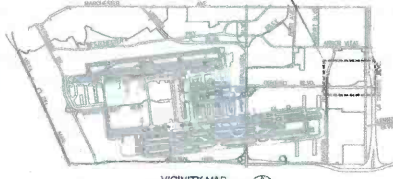
VICINITY MAP LOS ANGELES WORLD AIRPORT NOT TO SCALE